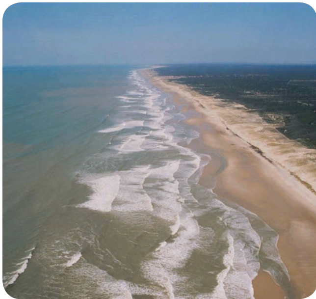
Morphology of the Aquitaine coast and the series of sub-tidal sand bars where the surf breaks, with bars and tidal pools connected to the aerial beach.

The environment has a determining influence on air, land and maritime operations and exercises. However, nearshore forecasts are largely inferior to offshore forecasts, which limits the choice of landing points. Moreover, the bathymetric and topographical information available are limited to static information which do not take into account the variability of the environment. As an example, sand bars that are destroyed and reformed after a storm can prevent access to the shore.