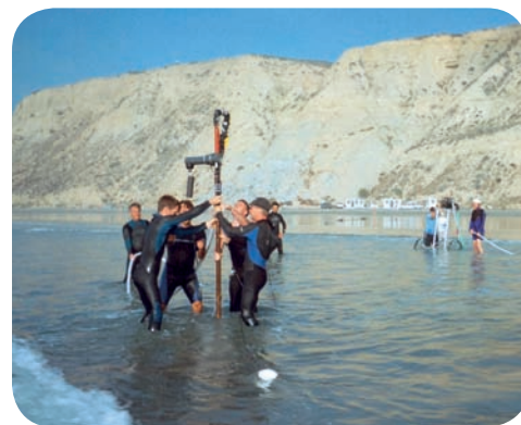
Installing the current meter in the surf zone during the NCEX campaign in 2003 (La Jolla, California).