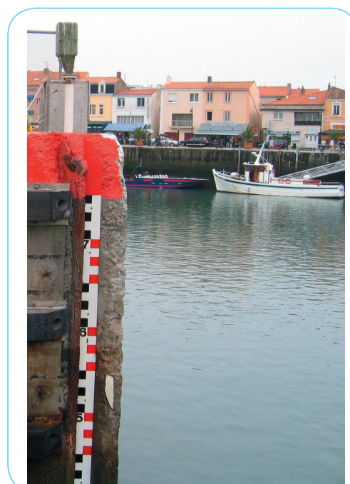
SHOM observatory in Les Sables-d'Olonne (digital coastal tide gauge and tide staff)